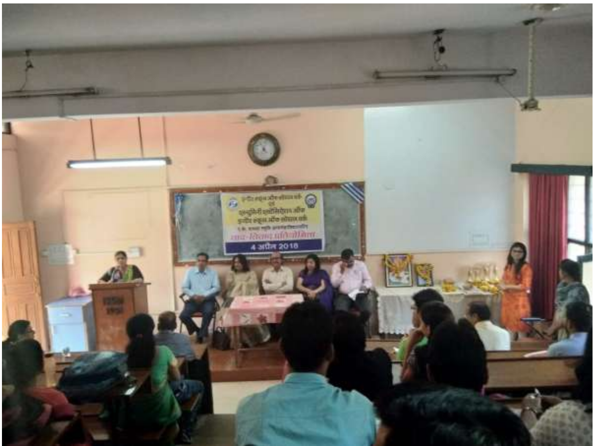
M.A Final student participating in Intercollege Debate Competition.