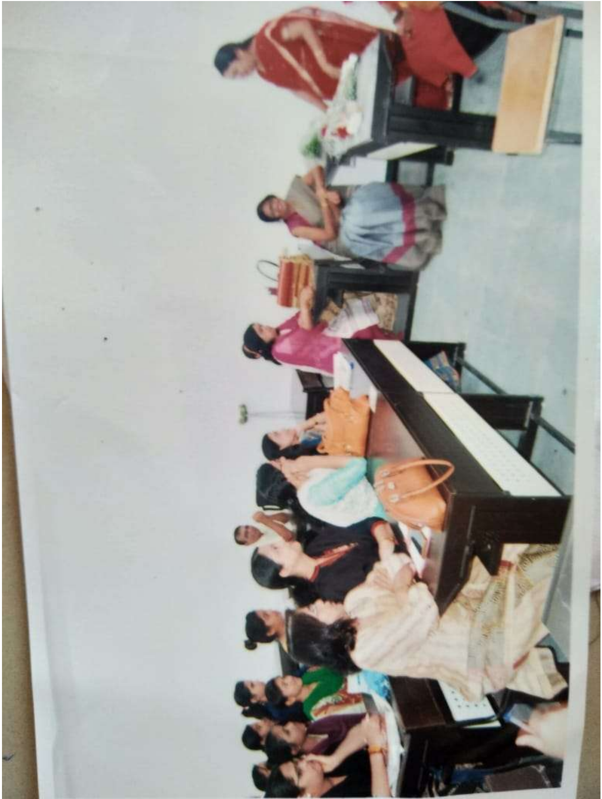
Workshop On “Editing.”