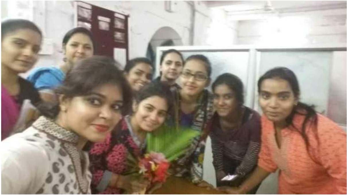
Literary Club Activity.