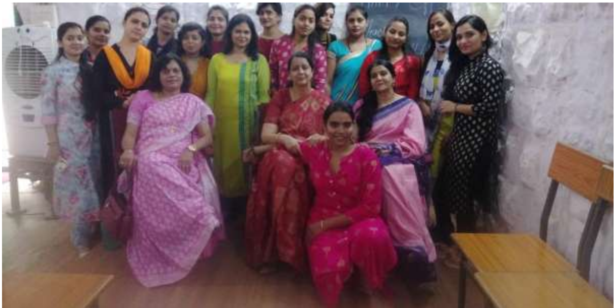
Workshop on 'Journalism and Literature.'