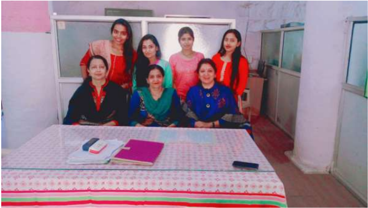
Presentation and Viva of Internship Projects of M.A. Final and B.A final Literature.2018