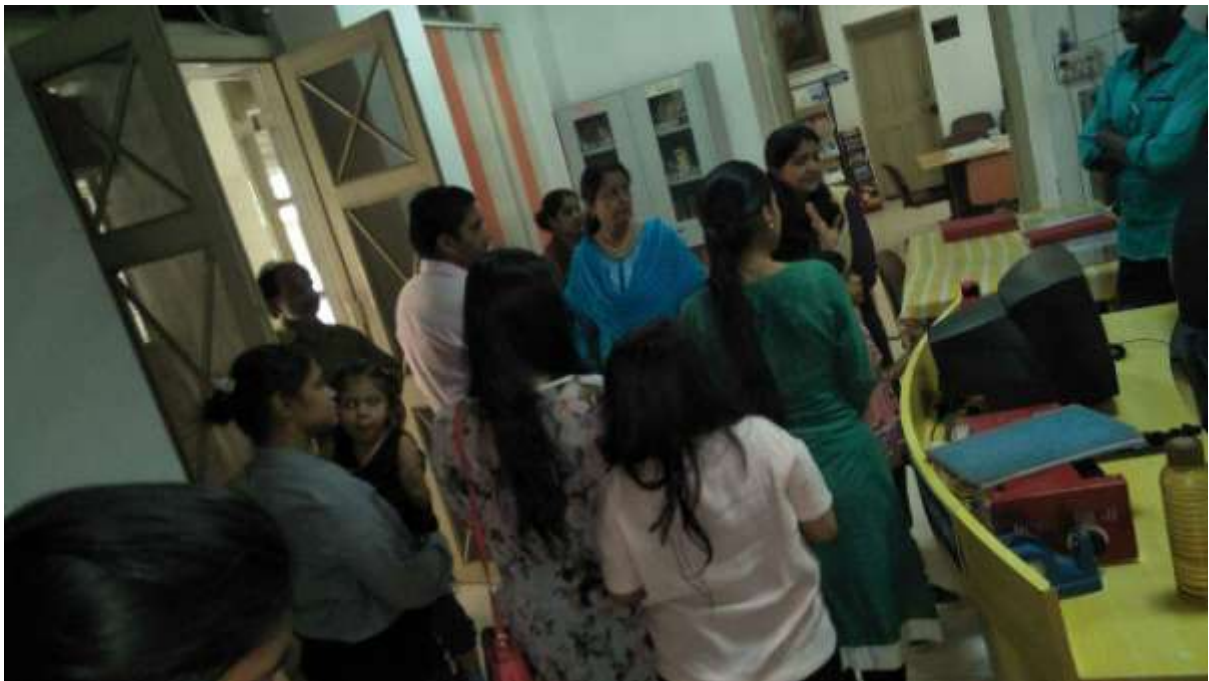
“Digital India A Bane or A Boon”:Library Visit.