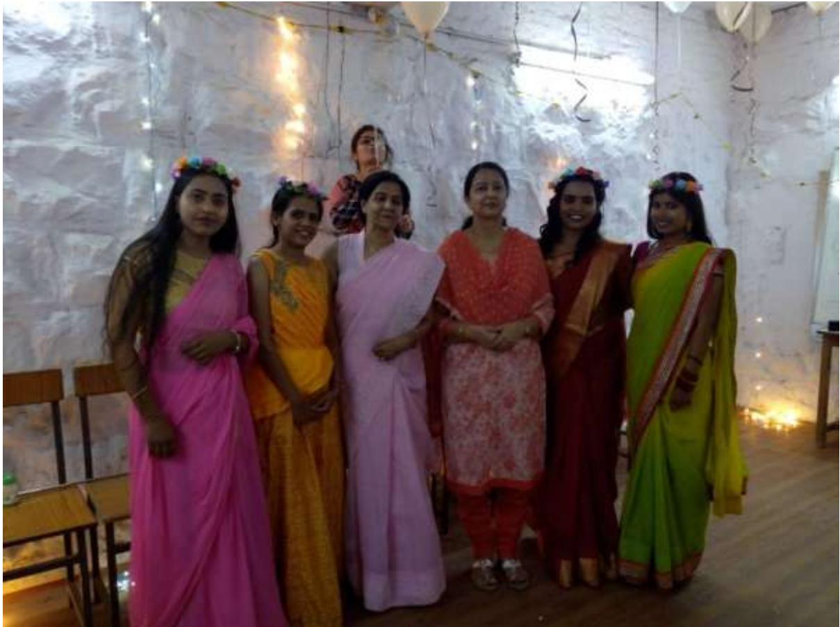
Bidding Farewell to M. A. Final students.